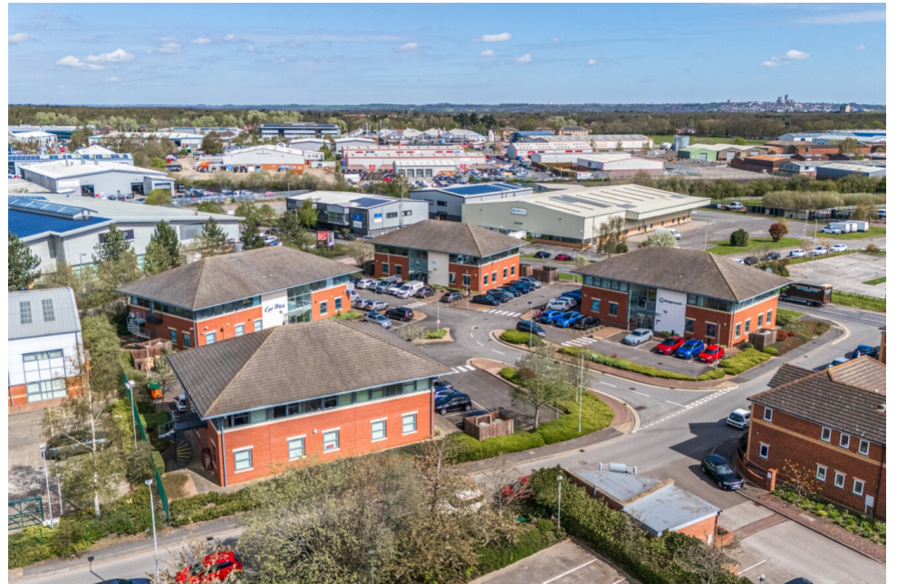
Leidos Building 1, Kingsley Office Park, Runcorn Road, Lincoln, Lincolnshire, LN6 3TA