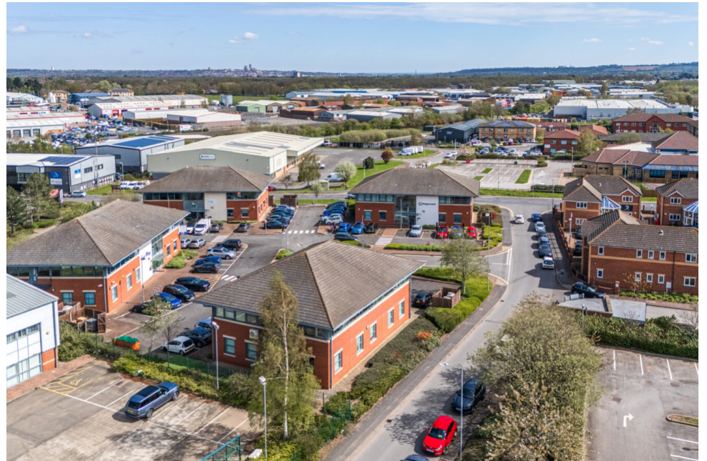
Leidos Building 1, Kingsley Office Park, Runcorn Road, Lincoln, Lincolnshire, LN6 3TA