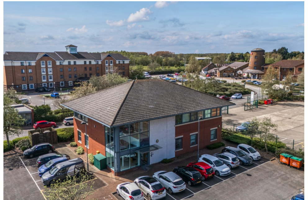
Leidos Building 1, Kingsley Office Park, Runcorn Road, Lincoln, Lincolnshire, LN6 3TA